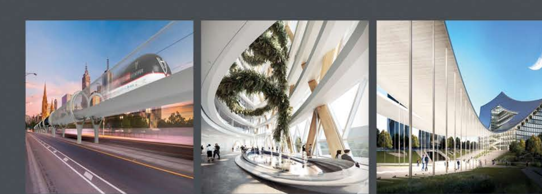
Best selection of urban and architectural most innovative and sustainable concepts and projects